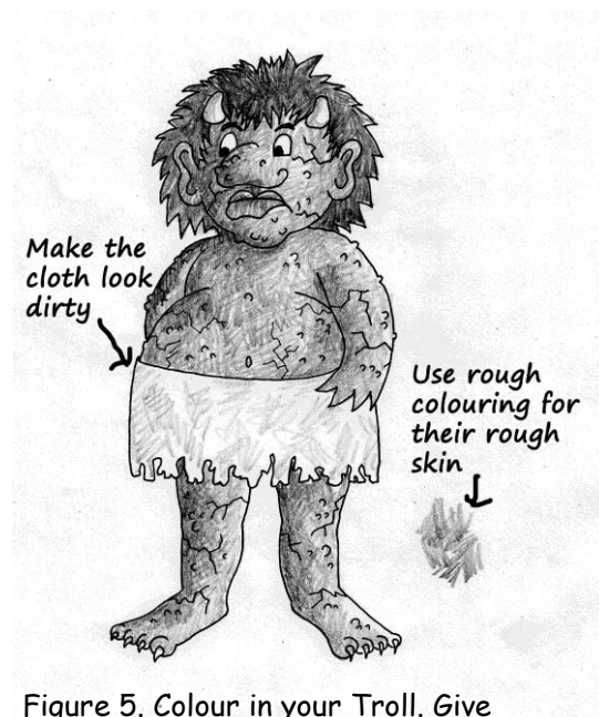
Figure 5. Colour in your Troll. Give him (or her) a really ugly name.