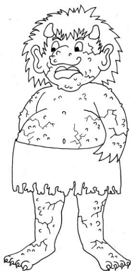
Figure 4. Go over all the important lines in black pen. Erase all the pencil marks.