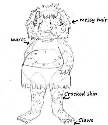
Figure 3. Add more details (still in pencil) like hair, warts and cracks in the skin.